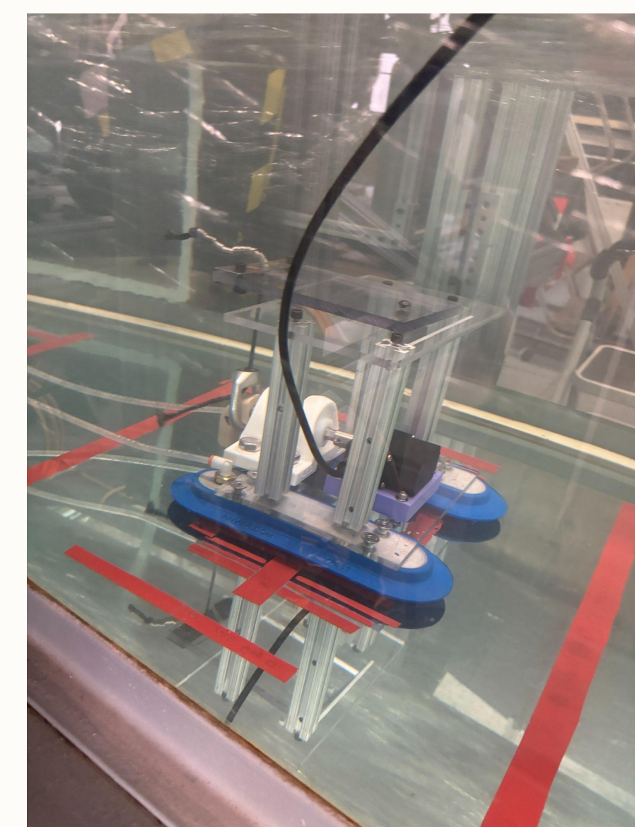
Flume Testing at the HHL

These tests prove resilience against the two primary failure modes, unreliable actuation and environmental degradation.